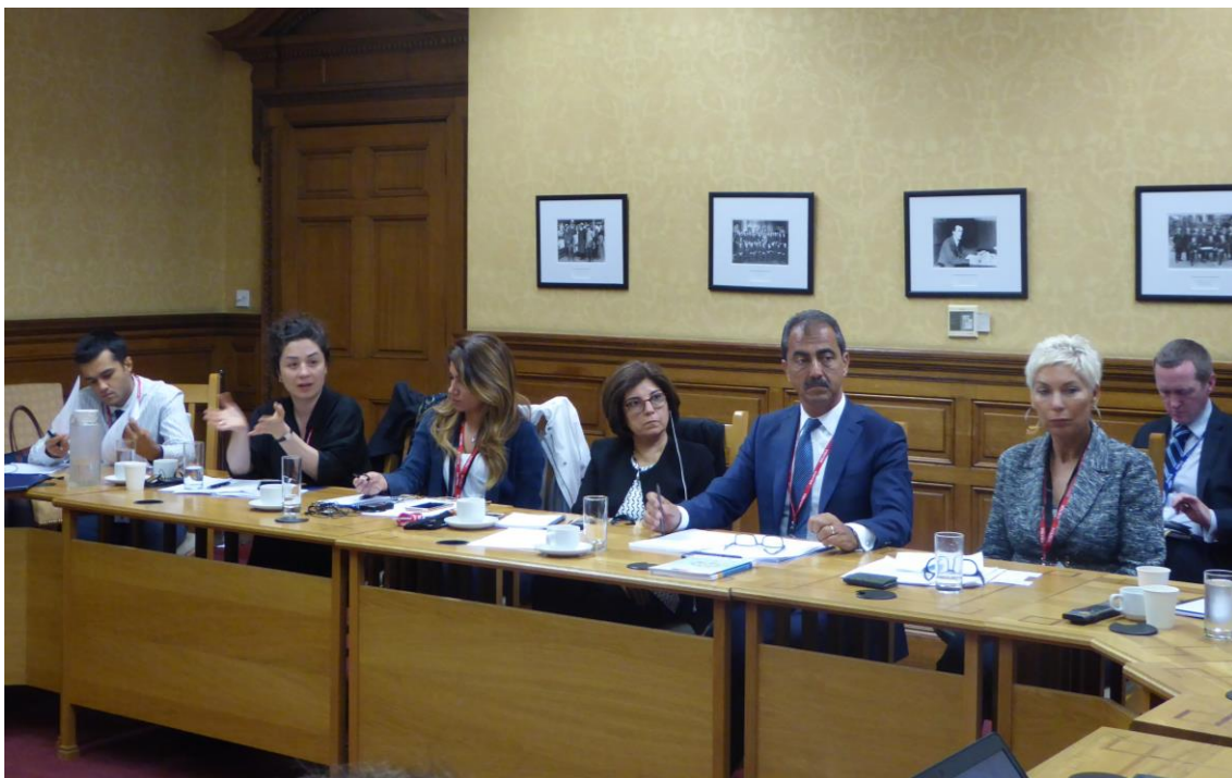
Participants discuss with speakers