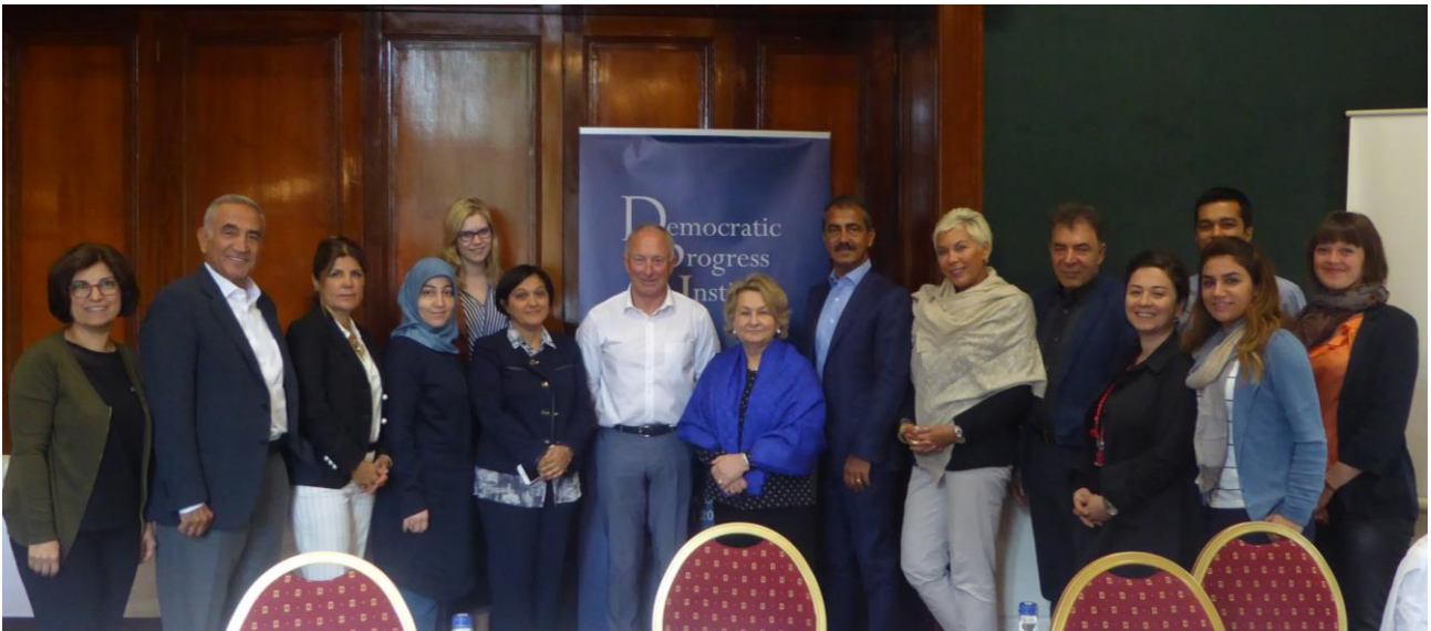
Participants with former Irish Minister of Foreign Affairs and Defence, Dermot Ahern

Overall the comparative study visit proved to be informative and engaging for the participants with valuable sharing of experiences from the Irish experts. DPI intends to build on this visit through ongoing work in the area of business, the economy and conflict resolution, and will continue to draw on comparative case studies.