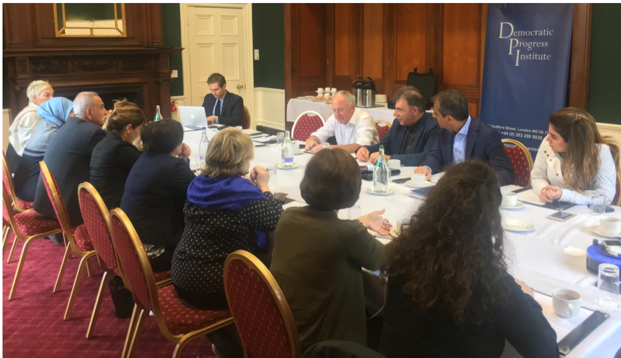
Dermot Ahern discusses the economic changes experience after the peace process