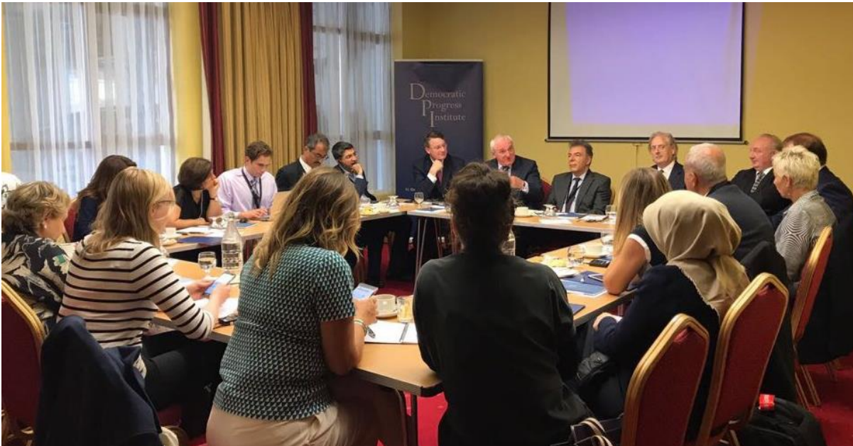
Roundtable with Bertie Ahern

grid, a company involved in building subsea cables, 1 gigawatt cables across borders. Electriona is an electricity trading platform which is a business that enables the trading of electricity between people and across borders which is important and a huge policy of the EU. I am the chairman of Dundalk institute of Technology but I have also chaired the fourteen institutes of technology in Ireland in a two year period. Dundalk is a third level education institution that sits about halfway between Belfast and Dublin. It is because of these third level institutions that the process could become technically resolved, immediately when these institutes got involved in partnerships with each other, the real dividend of peace started to arise and real peace was imminent.