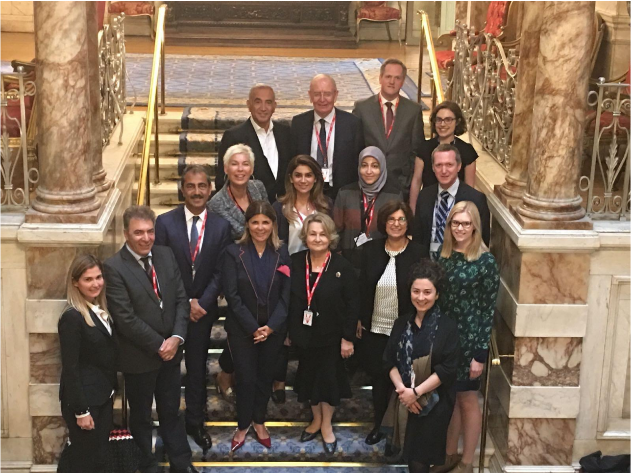
Group photo in Iveagh House, Irish Department of Foreign Affairs and Trade