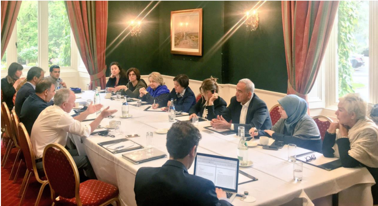
Roundtable with Dermot Ahern

number of times the Union Jack would be flown to 17 and the Unionists objected. This is where social media comes in; social media and Belfast was thriving, economics were coming back. That weekend a row grew and social media went into half orbit and in hours 10,000 young people who haven't been protesting before, they were out there because of this issue with the Union Jack. Now you have to live with it in politics and I am glad that I am out of politics.