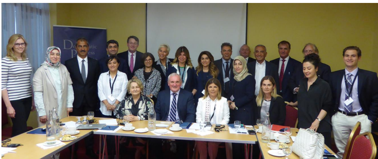
Participants with former Irish Taoiseach, Bertie Ahern.

This was the first visit carried out by DPI exploring the relationship between conflict and the economy and the role of business communities in encouraging and supporting peace, which DPI considers an important factor in working towards a conflict resolution process. It builds on and complements DPI's work on related topics including the role of women and of civil society in peace processes, as well as means of getting a process back on track and continuing dialogue in difficult times. It also reflects DPI's belief that such challenging times as Turkey is now experiencing, with mutual distrust on all sides and continued violence in the southeast of the country, can provide an important opportunity to prepare society for the moment when the process regains momentum.