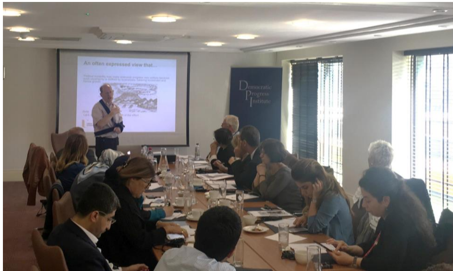
Dr Esmond Birnie discusses the economic implications of political instability