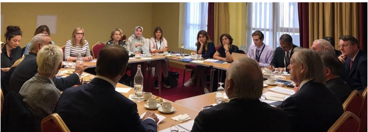
Participants during the roundtable with Bertie Ahern.

Thank you very much for coming and I hope you have an enjoyable trip. My background is in the retail business. I owe a lot of my good fortune to ladies; my grandmother started a retail business in 1937. She was a tailor by profession when she was younger. Interestingly enough, my grandfather was from the north of Ireland and he moved south and worked as a plumber and he married my grandmother in 1935. Prime Minister Ahern talked about how this was a difficult time because of the big north/south divide. My grandfather had a protestant background and my grandmother was a Catholic; but the children were raised as Catholics which was tradition of the church. The occurrence at that time was you had to have permission by the church to get married. Not only did you need permission, you were not supposed to get married at the altar, you were supposed to get married beside it.