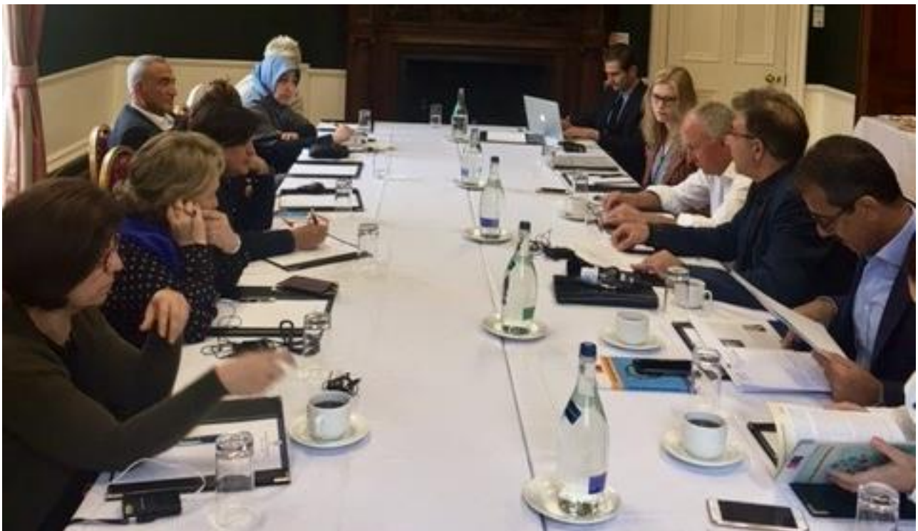
Roundtable with Dermot Ahern

I often say, the British and Irish government have to hold their hands because they cannot be trusted to govern their own state. I'm not sure if I answered your question because it doesn't really relate to my ministry.