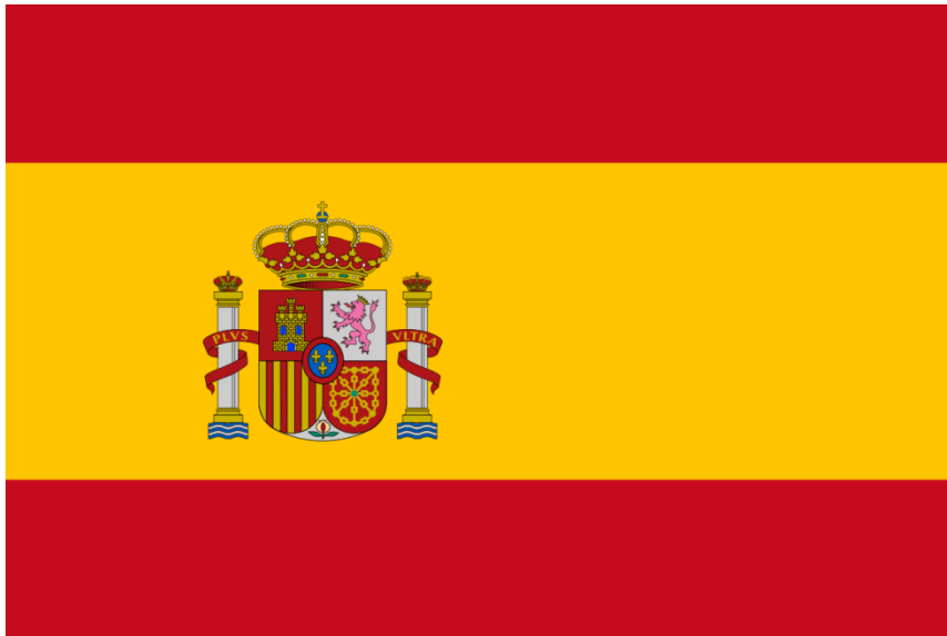
La Rojigualda: flag of Spain