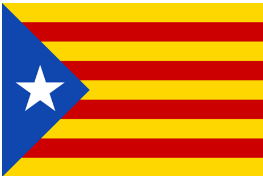
Estelada: flag of Catalonia