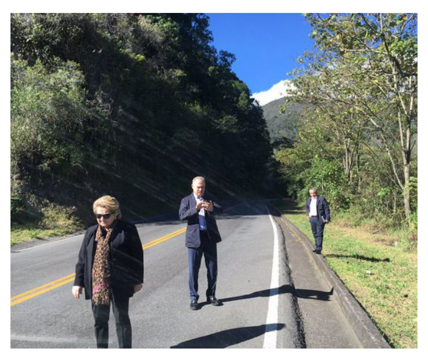
DPI Comparative Study Visit participants on a field visit to San Juan de Pasto in the region of Nariño, one of the most conflict-affected areas of Colombia

With the current stalling of the Kurdish resolution process, comes a clear need for platforms for dialogue among all stakeholders involved, and for opportunities to look beyond Turkey to draw from international experiences. Having identified this need, DPI invited 11 high-level delegates, representing all of Turkey's main groups in society, however divergent, to come together in a way which would not be possible within the country, to learn from the experiences of Colombia and to spend a week together in a "safe" and neutral setting, away from the conflict environment and the glare of the media.