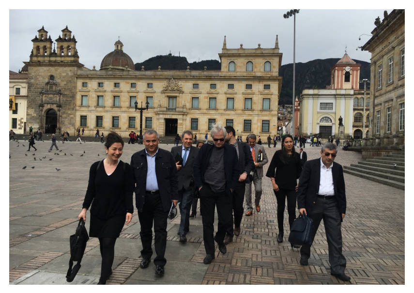
DPI participants and staff at Bolivar Square in Bogotá following roundtable meetings at the Congress of Colombia