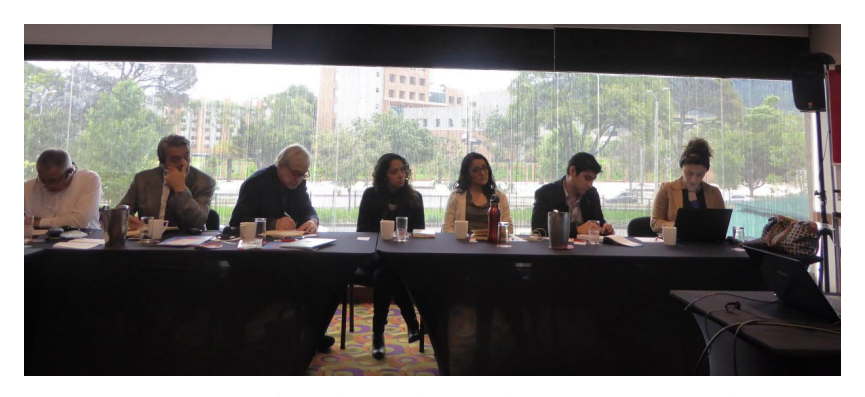
DPI participants and Fundación Ideas para la Paz representatives during a roundtable meeting on the role of business leaders in Colombia's peace process

All participants have shared learnings with their respective communities and constituencies, through compiling detailed reports on the visit - in the case of political party representatives this shall be shared with their respective parties including leadership, reports will also be shared with the Prime Minister and President by their advisors who took part, and the participating journalists and media representatives have published numerous articles and columns on the visit, many of which have attracted significant interest (with one article attracting 44,000 views on the day of its publication, four times the usual number). Civil society representatives have shared their intention to share with their communities, and academics will share learnings through their educational fora and through academic articles. Well known popular figures taking part in the visit have served to attract significant media attention and the visit has been documented throughout Turkey's media as well as on social media, allowing for the learnings from Colombia to not only be experienced by those taking part in the visit, but among society as a whole.