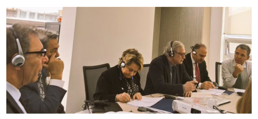
Participants meet with Alberto Lara, Former Minister of Justice and Minister of Defence for the Colombian Government and General Director, Social Development Group to discuss the role of social development in the Colombian peace process

process, and the inclusion of a victims' delegation at the negotiating table in Havana was discussed. The role of the Colombian government's victims unit currently in operation was analysed in detail.