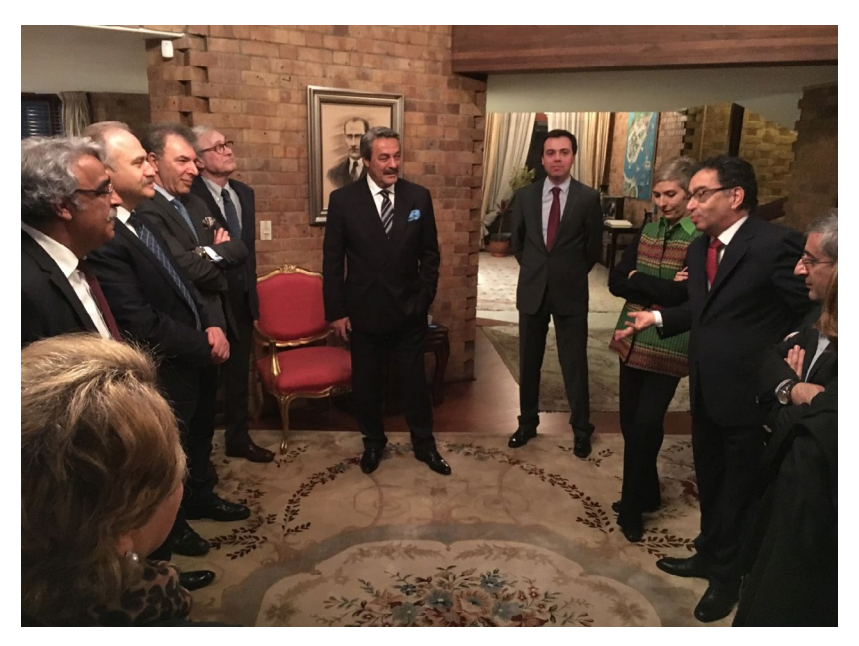
DPI participants and staff with Turkish Embassy representatives during a dinner reception hosted by Turkey's Ambassador to Colombia

Also discussed in this context was the impact outbreaks of violence had on the process, both on the part of the armed forces and the guerrillas, in the absence of a formal, bilateral ceasefire. A number of speakers stressed the usefulness found in holding talks outside of the country in this regard, in order to separate the process from events and violence taking place internally, and to keep it on track in spite of active conflict. The divergent views of the parties relating to DDR and the form and timeframe this should follow, were seen to be a factor threatening to bring the process to a halt, and speakers shared about the need for flexibility and expectation management regarding deadlines set for agreement on sensitive issues.