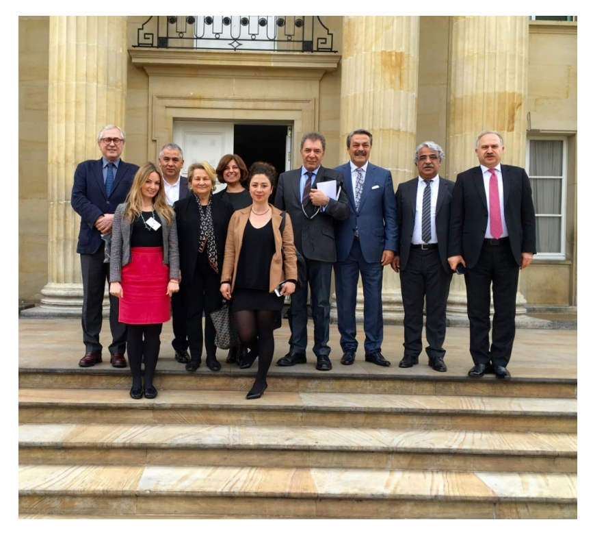
DPI delegation and staff at the Presidential Palace in Bogotá