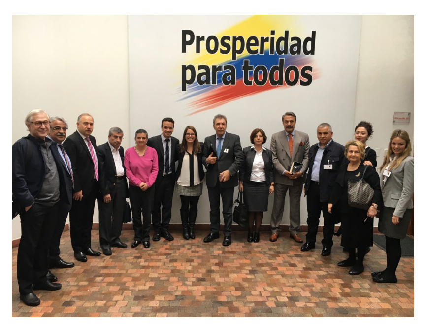
The delegation with representatives of the Office of the Colombian Government's High Commissioner for Peace

The inclusion of a gendered perspective within the Colombian peace process was discussed, and speakers shared on the gender sub-commission formed of both government and FARC representatives as a key mechanism to ensure the application of a comprehensive gendered approach to every aspect of the process. Speakers also discussed the role played by delegations of gender experts who have attended the Havana negotiations to make proposals in this area. Key women actors in the process were met with, including a woman former combatant, who shared on her first hand experiences from a gendered perspective.