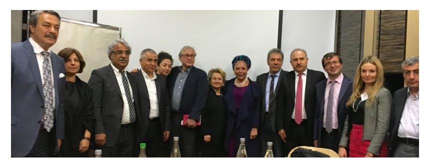
DPI Comparative Study Visit participants and staff with Piedad Cordoba, a lawyer and politician currently engaged with the Havana talks

The visit has built on previous comparative study visits carried out by the Institute, in particular regarding the topic of "getting a process back on track" and maintaining a process during difficult times. The visit also built on DPI's work in the specific area of gender and conflict resolution, and will serve as a strong foundation for continued work in these areas.