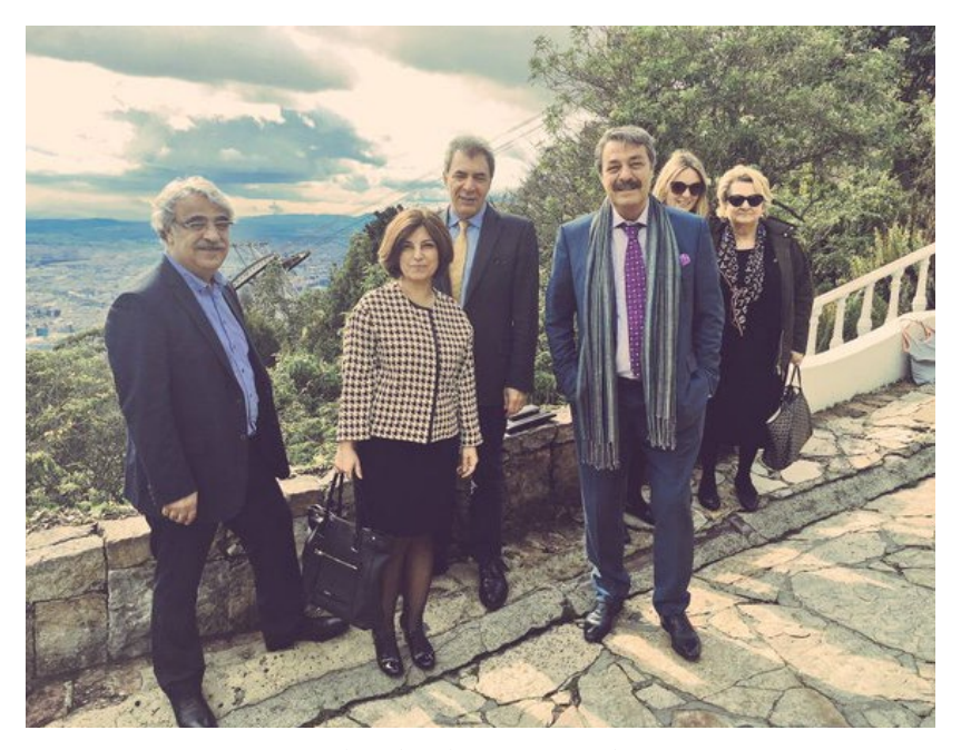
DPI participants and staff at the Sanctuary of Monserrate in Bogotá