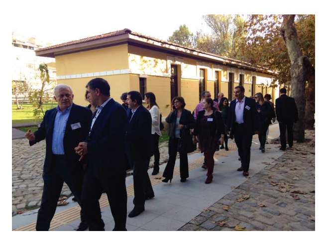
Participants during a break in the roundtable.