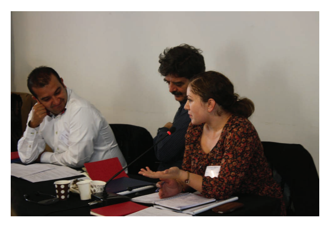
Participants at the roundtable.

Participant: No one has spoken about the solution process in Turkey. TZP-Kurdi has been active in the region for years now, advocating for Kurdish education. The universities, NGOs and media should support this process and universities should prepare data for media, which should be shared with the public. Support from the EU is also very important for the improvement of the situation of language minorities in Turkey.