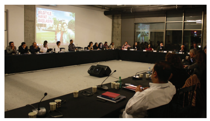
Discussions during the second session of the roundtable at Bilgi University in İstanbul.

Participant: This is a very important question. What kind of education do we foresee or want? Is it enough if we just have Kurdish language education? First of all, the overall mentality should be changed. The point of departure is how to convince people who have been poisoned by this understanding of nation states as responsible for education. This would of course have an impact on education, and all the other spheres of life, by developing a more pluralistic discourse and practice. The state providing Kurdish language education is not enough. We have undertaken a field study in which we looked into examples from the rest of the world, looking to draw conclusions about the type of training or education model that should be implemented. It is important to not only focus on Kurdish matters. Instead, we should to create a pluralistic education model in which there are many different languages. A preparatory process for the curriculum is also being worked on.