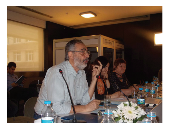
Speaker, Etyen Mahçupyan

generating information and knowledge is helpful, but knowledge can only be the language of politics; it cannot be real politics itself. If the NGOs can go into politics with the knowledge they create and generate, then I believe they will be part of conflict resolution.