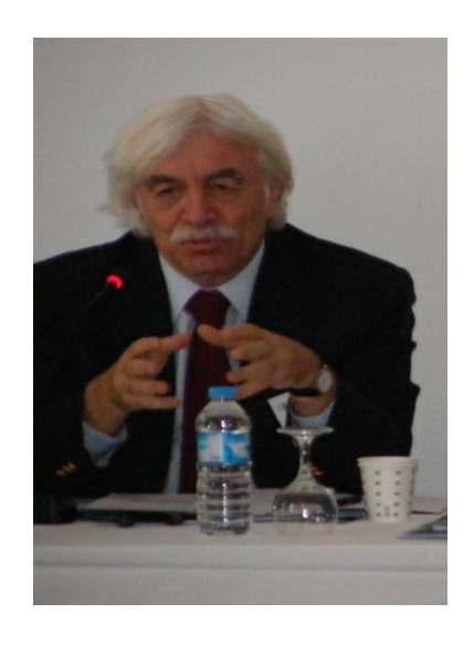
Speaker Cengiz Çandar

DPI's activities have included all of Turkey's main political parties, including the governing AK Party and also the main opposition Republican People's Party (CHP), and the Peace and Democracy Party (BDP). Members of Parliament from all of these parties have attended the meetings of DPI and have taken part in various studies. The Comparative Study Visit to Northern Ireland was of particular interest and relevance to participants.