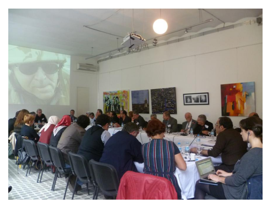
Participants and speakers during DPI's roundtable on the role of local media in conflict resolution

I have read two news sources, one is Radikal one is Taraf , but there are no reports about the hunger strikes. Nobody has the right of medical intervention against those who carry out hunger strikes. I think it is a way of saying 'let them die' because such an approach does not have to do with human rights. Human rights cannot be given up or transferred. This is why we prevent people from committing suicide. We can intervene with the hunger strikers. In the news they were clearly taking sides.