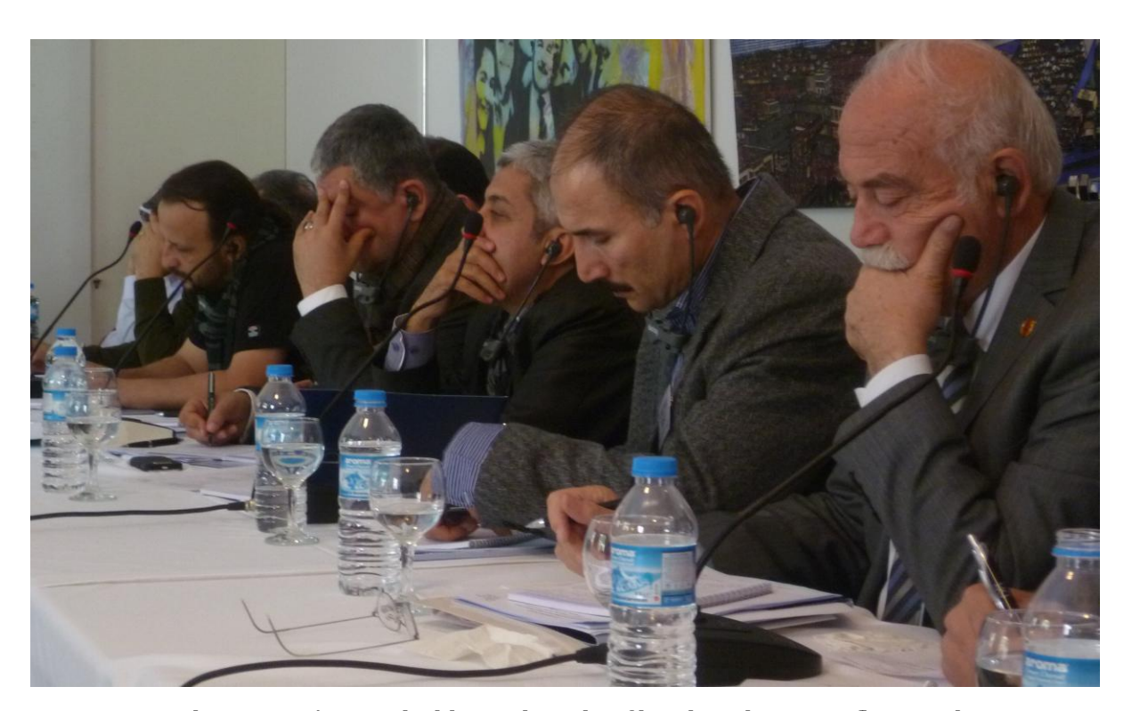
Participants during DPI's roundtable on the role of local media in conflict resolution

They try to explain themselves with patriotism but they work for the government. They are like public officers, they do not have freedom. My colleague says he did not have the opportunity to see the governor. They do not give information and knowledge to journalists about the deaths of the 17 martyrs, which took place a few days ago in the country. There are terror issues, but on the other hand, we have the hunger strikes in the jails and in the prisons. These are important issues. In Batman we had a meeting and I said that everything is audited and that the government party Members of Parliament put pressure on them because nobody can say anything to the Prime Minister. In the last meetings of the parliament, the Members of Parliament for Siirt said that the next day they would see the Prime Minister. I told them that this person is selected from the province with all votes. Unfortunately, no solution came out of the meeting. So there are journalists who will be named as 'journalists of the government'. A senior journalist in Turkey came to the event area in the Prime Minister's helicopter. Imagine! The journalist is travelling in the helicopter of the Prime Minister. I see that this problem cannot be solved like that. This is what I see.