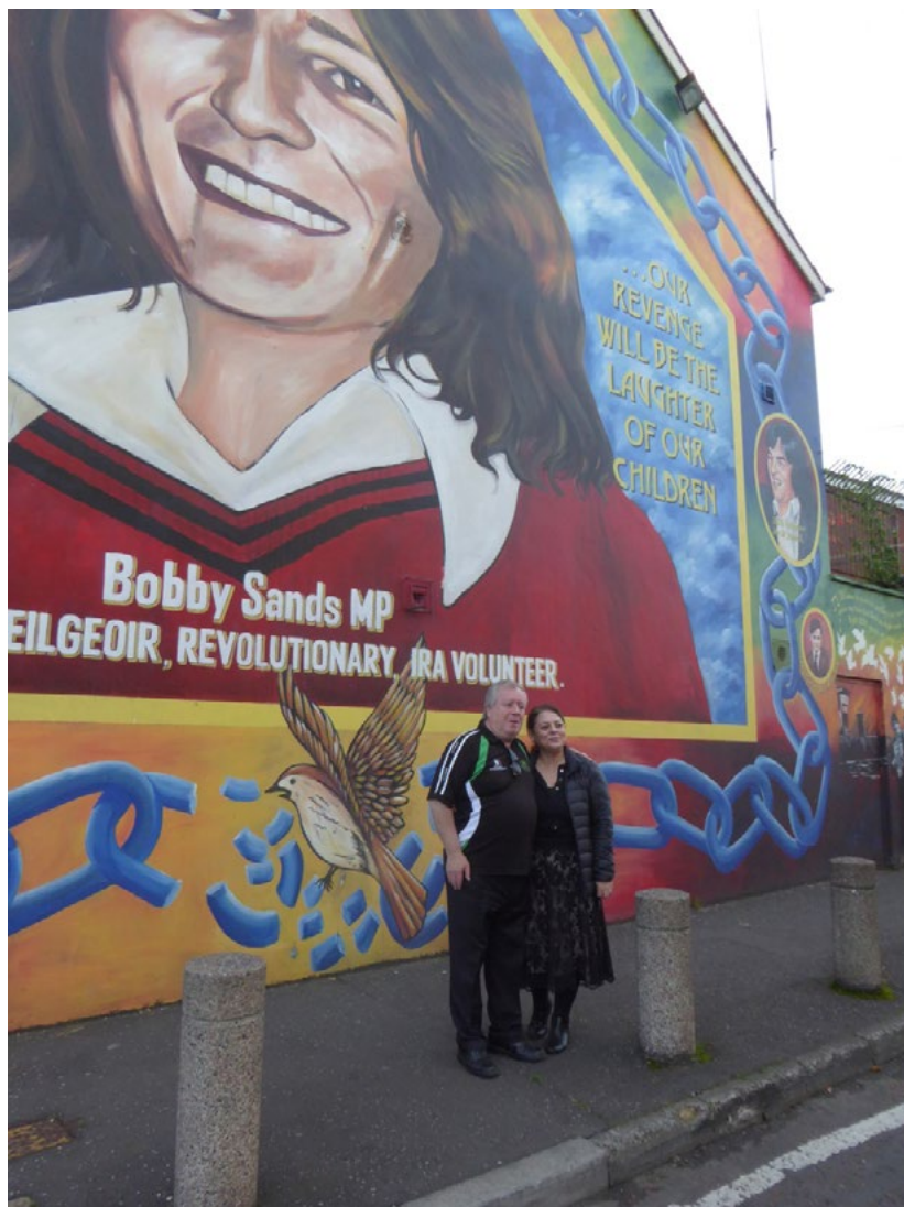
DPI participant with a Republican former political prisoner and community worker in front of a mural depicting Bobby Sands on the Falls Road in Belfast