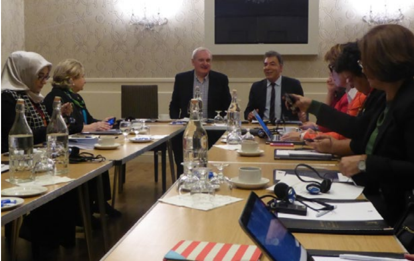
Bertie Ahern, former Taoiseach, meets with DPI participants for a roundtable meeting in his former constituency Drumcondra

In addition, Dermot Ahern, former Irish Minister for Foreign Affairs reaffirmed to our participants that courage, determination and persistence is crucial to the success of a peace process. He discussed the importance of confidence building measures to build trust between parties, and to keep them engaged in a peace process. A founding principles of the GFA; 'nothing is agreed until everything is agreed', was also discussed at the negotiating table. This allowed for greater honesty and discussion between parties, and strengthened the sustainability of the peace agreement.