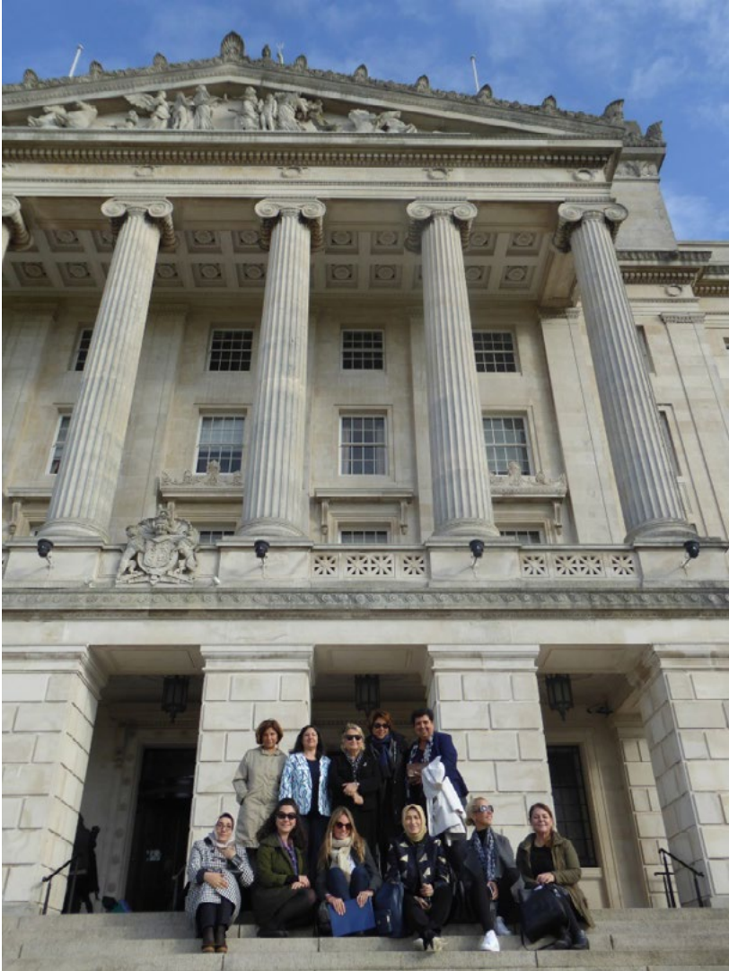
DPI participants in front of the Assembly Building, Stormont, Belfast