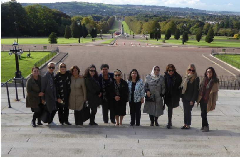
DPI Participants outside the Northern Ireland Assembly Building in Stormont, Belfast

'I've spent fourteen and a half years going to EU Council meetings and one thing I will say is how pivotal Europe regarded Turkey as being as part of the solution to the conflict that is taking place in the wider region.' – Dermot Ahern, former Irish Minister for Foreign Affairs