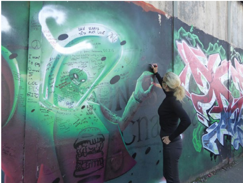
DPI participants sign the peace wall in Belfast's interface area on Shankill Road

ongoing questions on role of identity in the conflict resolution process. This dialogue allowed for a deeper understanding of the issues still affecting the people of Northern Ireland today, including economic factors, commemorative events, anniversaries and parades.