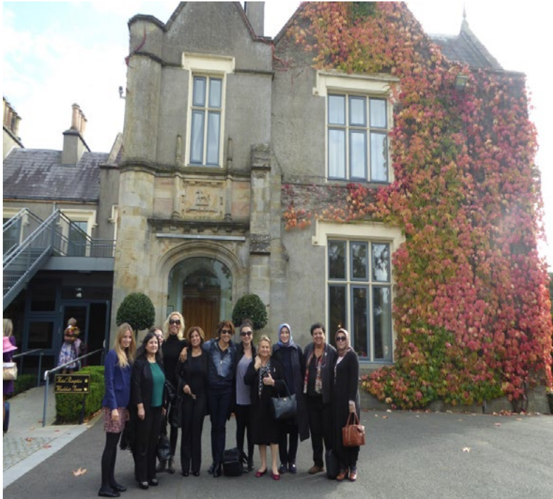
DPI Participants visit Ballymascanlon House Hotel, Dundalk, for a roundtable meeting with former Foreign Minister Dermot Aherne