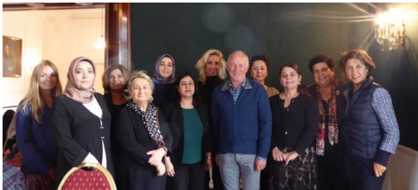
DPI participants with Dermot Ahern, former Irish Minister for Foreign Affairs, in Dundalk

DDR . Discussion centred on the criteria necessary to selecting a third party and the ways in which third parties can assist in providing structure to a peace process, as well as in relation to accountability and verification. Importantly, Dermot Ahern highlighted how the role of third parties in the Irish context internationalised the peace process, which made it a priority on the global stage. This internationalisation by the US and the EU not only encouraged peace negotiations, but also provided the necessary funding to allow for sustainable peace in Northern Ireland.