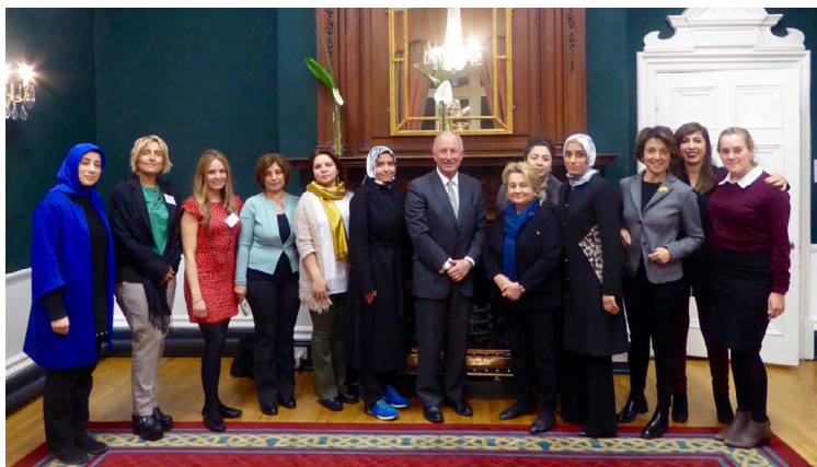
Dermot Ahern, former Minister for Foreign Affairs in Ireland meets with DPI participants in Dundalk.

Legislative and constitutional aspects of the process were discussed at length with a number of speakers, including Kate Beggs of the British Government's Northern Ireland Office, with a focus on governance and power sharing. Discussion of the benefits and disadvantages of the D'Hondt system used in Stormont took place, with a detailed analysis of the devolution process and the relationship between the Northern Ireland Assembly and Westminster. Legal processes and reform were discussed in the context of equality and discrimination, including questions of policing and SSR (security sector reform) and in relation to gender quotas. The technicalities of referendum were also covered at length.