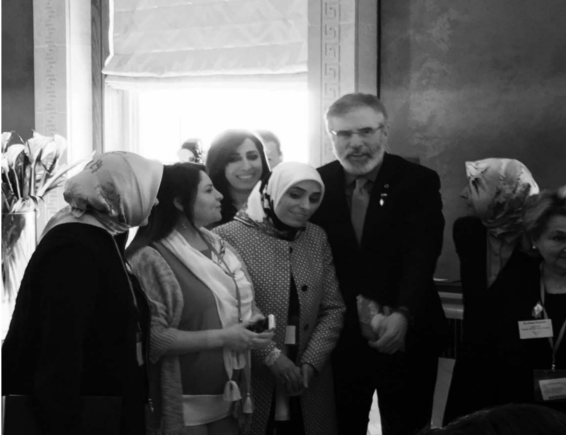
Participants meet Gerry Adams, Sinn Féin Party Leader.