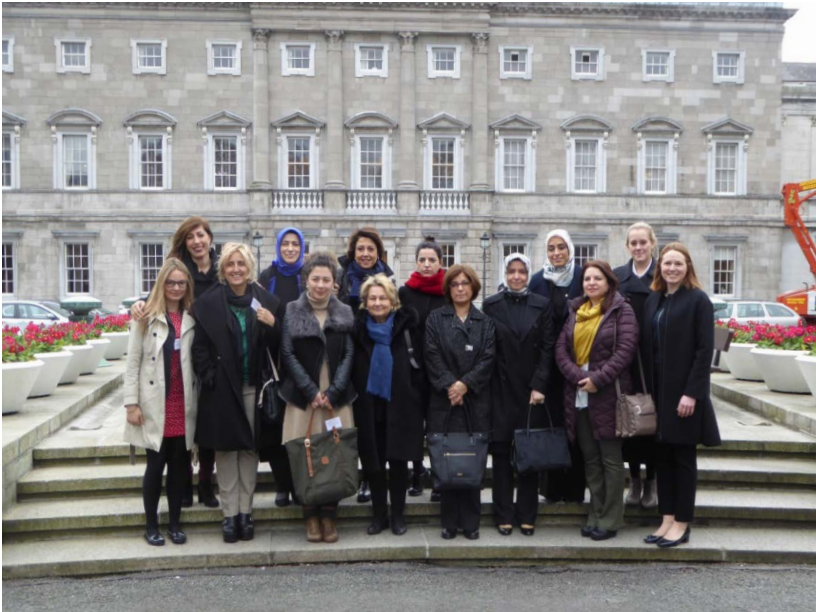
DPI Participants visit Leinster House in Dublin for a tour of the Irish Parliament.

DPI working papers relating to some of the key topics addressed ( including an update on the current context in Northern Ireland, and a briefing paper on the implementation of UNSCR1325 ) can be found at the end of this report. Other research papers on the subject of conflict resolution, and all previous DPI activity reports, can be found on the Institute's website: www.democraticprogress.org