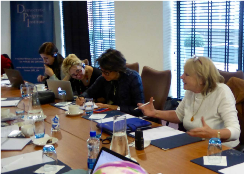
Jane Morrice, Deputy Speaker of the first Northern Ireland Assembly, Member of the Northern Ireland Women's Coalition, and Vice President of the European Economic and Social Committee, at a meeting with DPI participants in Belfast.

UN Security Council Resolution 1325 was discussed in the context of the Troubles and the present day – participants learned about the Irish government's National Action Plan for implementation of the resolution and heard from members of the Women, Peace and Security Oversight Group of Ireland's second NAP (2015-18). Questions relating to implementation of the principles of UNSCR 1325 in the absence of a NAP were also discussed, drawing on the experiences of Northern Ireland. Paula Bradley MLA, of the Democratic Unionists Party met with participants to discuss her role within a largely male dominated political party, and in particular her role within the All Party Group on UNSCR1325, discussing the practical ways in which 1325 can be drawn on and applied despite a lack of direct implementation of the resolution, and ongoing the politics of defining "armed conflict" in Northern Ireland.