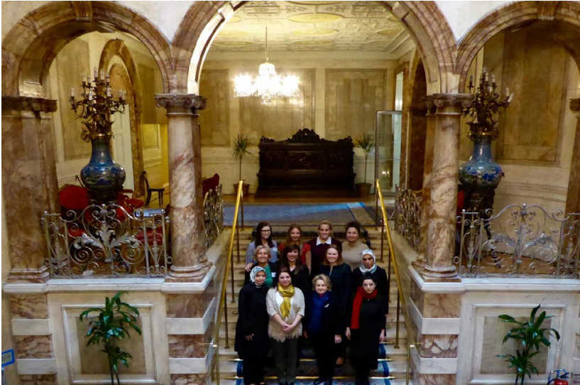
DPI Participants at Iveagh House in Dublin following their meeting with the Irish Department for Foreign Affairs and Trade

DPI shall continue to build on this visit through its ongoing work in the area of gender and conflict resolution, and will continue to draw on the ever relevant and valuable case of the Northern Ireland process in relation to the Institute's Turkey programme.