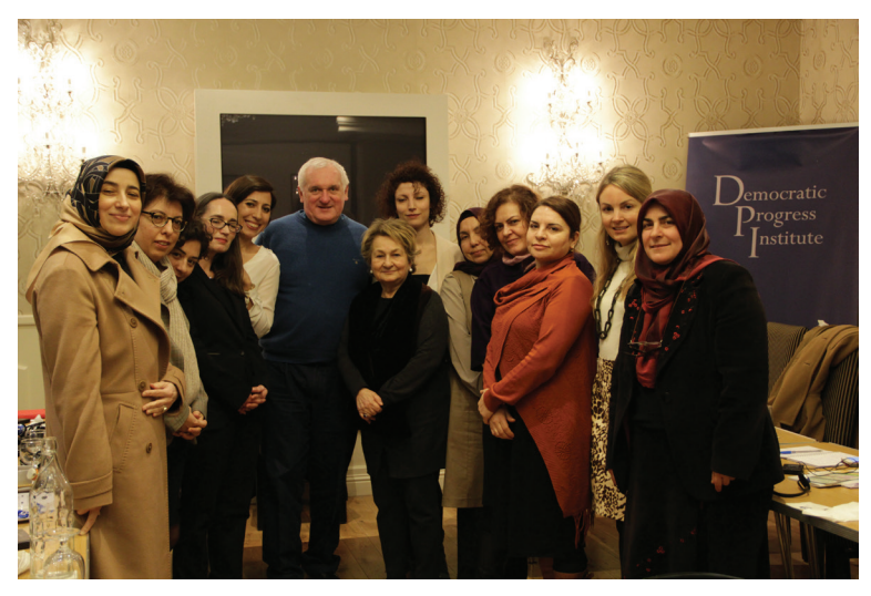
Participants with Former Taoiseach (Irish Prime Minister) Bertie Ahern at the Skylon Hotel, Drumcondra

With: Bertie Ahern, Former Taoiseach (Prime Minister of Ireland)