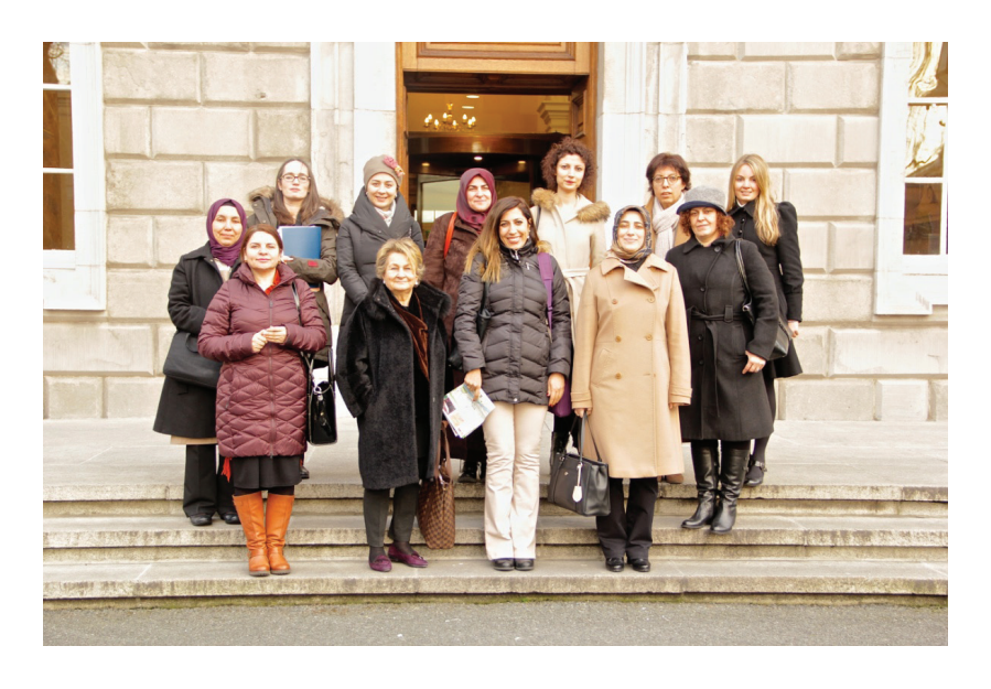
Participants in front of the Leinster House building, where the Dáil Éireann (Irish Parliament) convenes

To close the visit, participants engaged in a private tour of the Dáil Éireann (Irish Parliament), hosted by the Department of Foreign Affairs and Trade of Ireland. The tour was followed by a meeting with several TDs (Parliamentarians), in which participants had the opportunity to exchange views and ideas following the various roundtables held in Dublin during this comparative study visit.