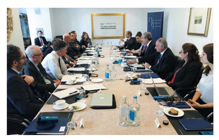
DPI advisers and AK Party delegation exchange views

The meeting provided a fruitful discussion and exchange with participants being able to hear the delegates' views on the current situation in Turkey and the wider region, as well as on the future of Turkey, including the relationship with the EU.