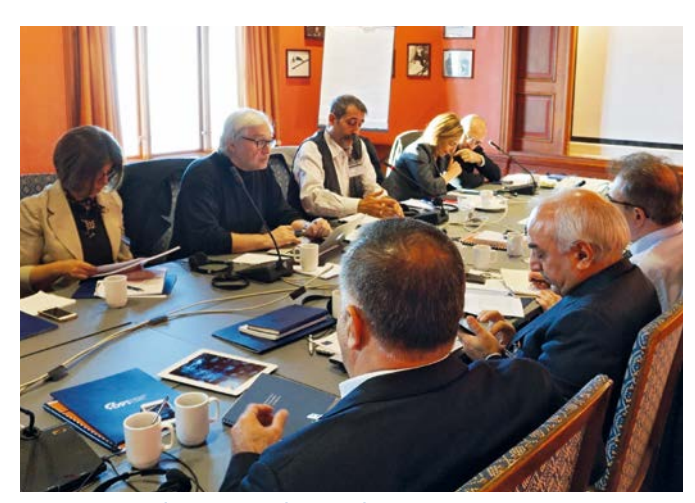
Participants discussing during the meeting

The event has also been covered by Turkish media, receiving positive feedback on newspapers, TV channels and on social media. Despite negative feedback has been received as well by some Turkish media, the fact that DPI's activities have appeared in the news show that society is eager to discuss the resolution process.