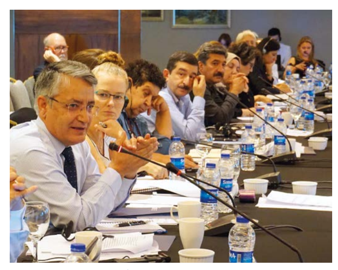
Some participants at the meeting

In September, a group of 50 participants, including politicians, policy-makers, civil society actors, academics, and journalists, came together to discuss experiences from peace and transition processes globally. The meeting provided a timely opportunity to review previous discussions on the nature of peace-making processes and highlighted the importance of preserving the foundations for inclusive dialogue between different parties and groups in society, even in the most challenging times.