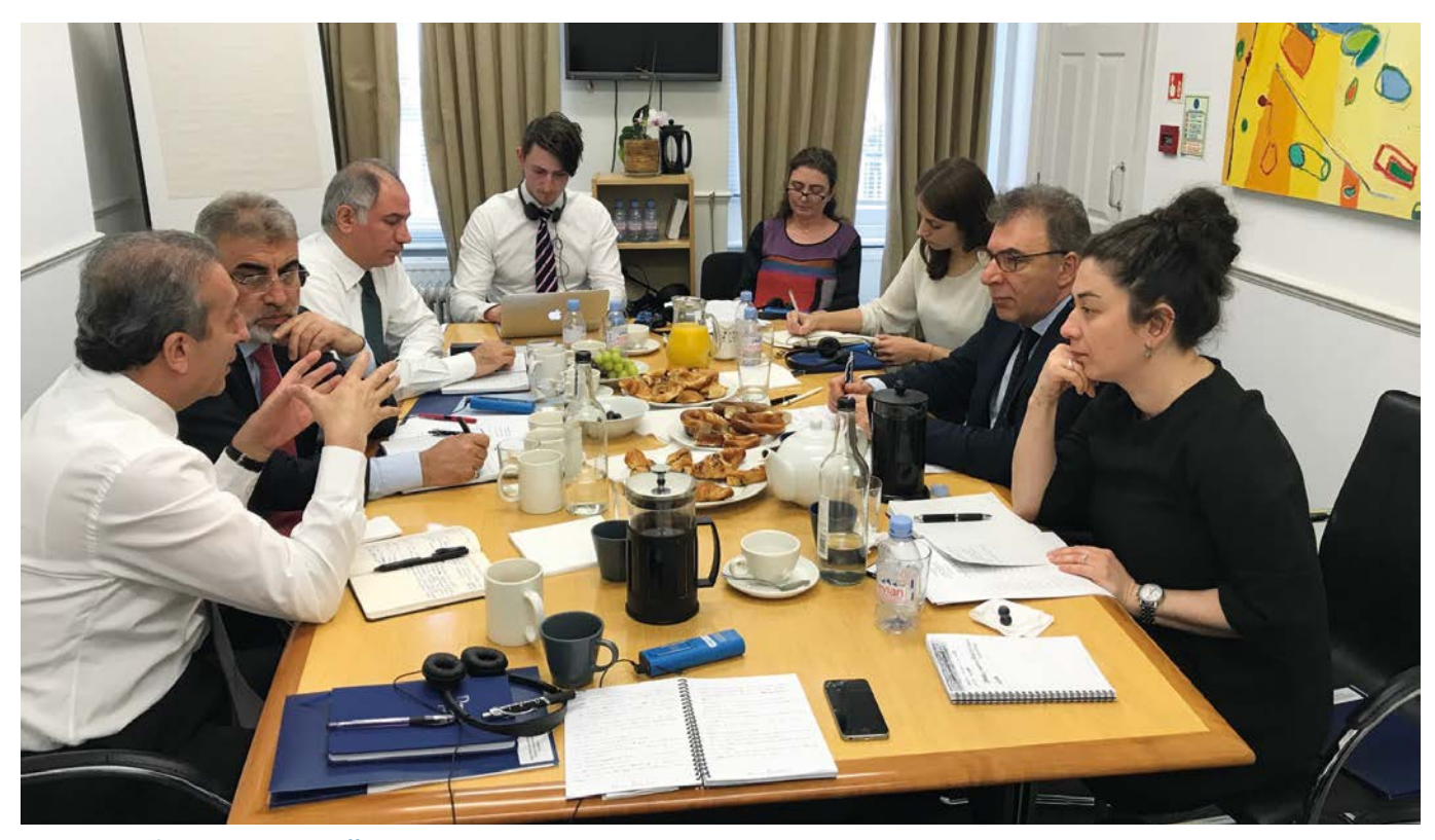
AK Party Delegation at DPI office

DPI activities are underpinned by the need for equal gender representation, but we have also held a number of roundtables focused on the specific role of women in conflict resolution. We held two roundtable meetings with this focus in Turkey, which were attended by a diverse female group of political and civil society actors from different regions and representing a broad spectrum of professions and political affiliations in Turkey. Participants included MPs and members of political parties, heads and representatives of human rights organisations, lawyers, businesswomen, media professionals, academics and figures from the art and literature worlds.