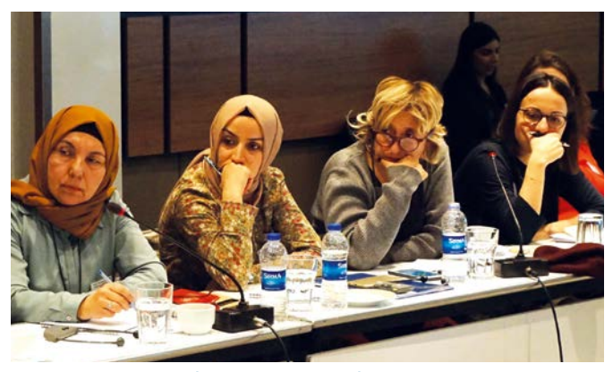
Some participants listening to speaker presentation

Many participants suggested that it would be useful to have a meeting to discuss women's role in conflict resolution in direct relation to the situation in Turkey. As such, DPI organised a roundtable held in December to focus on the sharing of international experiences and how the latter can provide lessons and insights of relevance to Turkey.