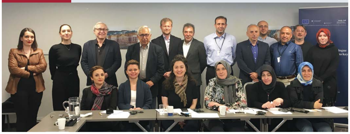
Some participants and speakers gather to discuss the role of the media in conflict resolution in Oslo

The role of media in conflict resolution, hosted by the Norwegian Minister of Public Affairs Oslo, 25-27 April