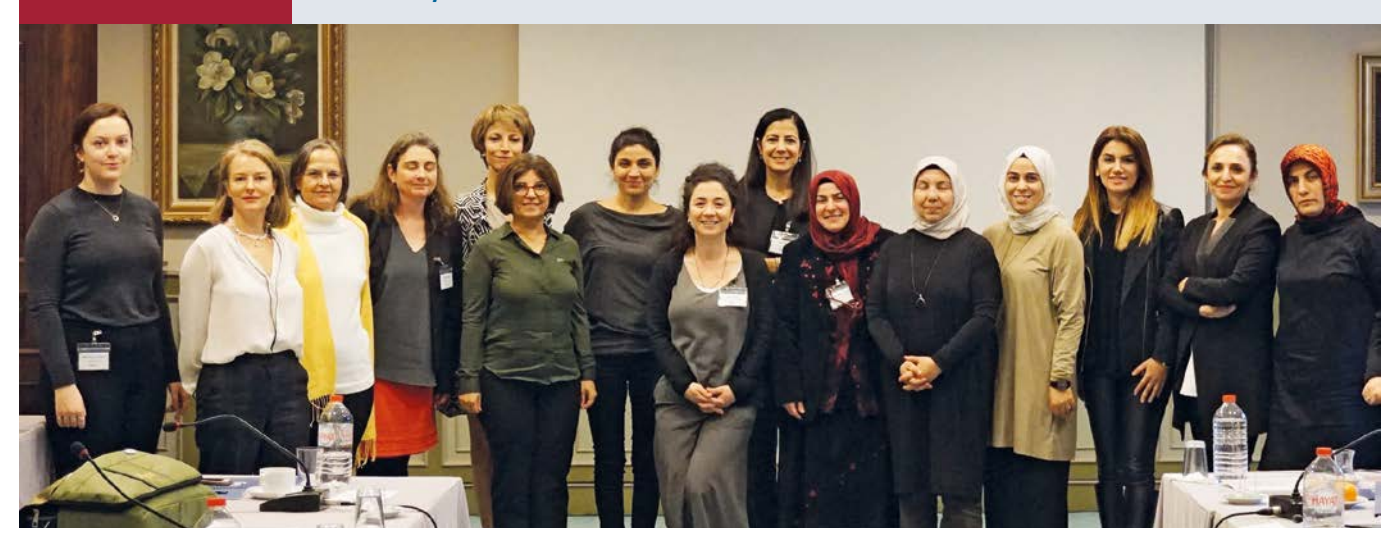
Some participants at the meeting on women in conflict resolution in Istanbul

In December, a diverse group of women participated at a DPI roundtable to reflect on women's contributions to sustaining dialogue and maintaining efforts to build peace.