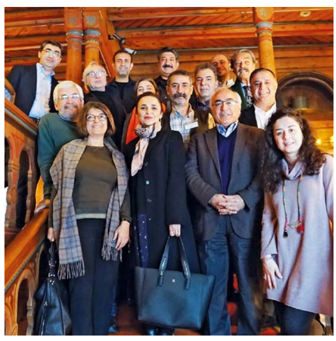
Some participants at the Roundtable meeting in Oslo

This roundtable was the second planned event under the theme 'Supporting Inclusive Dialogue at a Challenging Time in Turkey' and it was organised as a response to the requests of participants to the first roundtable that took place in May 2018. In fact, participants, after having heard and elaborated on international experiences about conflict resolution, they expressed their wishes to continue to address the theme focusing more specifically on WPC experience. Feedback from participants was helpful as it showed that they are looking to keep the conversation alive in the future. Hence, DPI will continue to work with them, and it will also expand the number of participants for bringing together more former members of WPC.