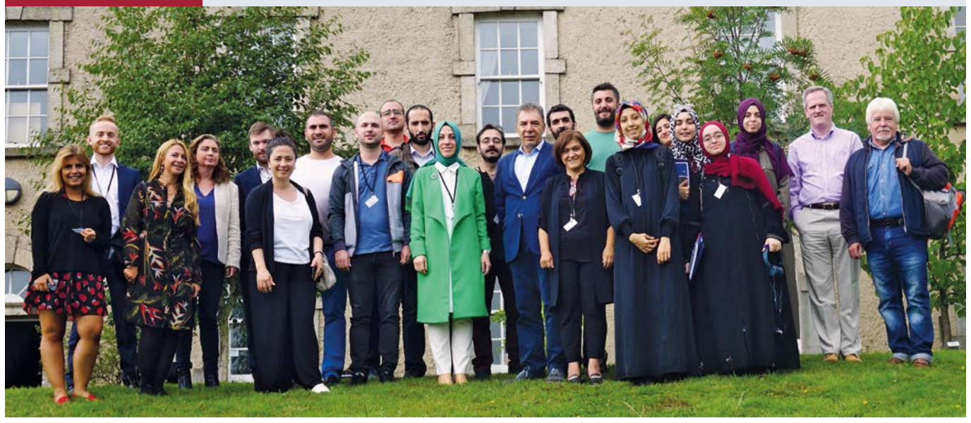
Youth representatives from Turkey gather during the CSV on youth engagement in conflict resolution at Glencree Centre in Co. Wicklow

Youth engagement in conflict resolution processes, hosted by the Irish Department of Foreign Affairs and Trade Dublin and Belfast, 1-5 August