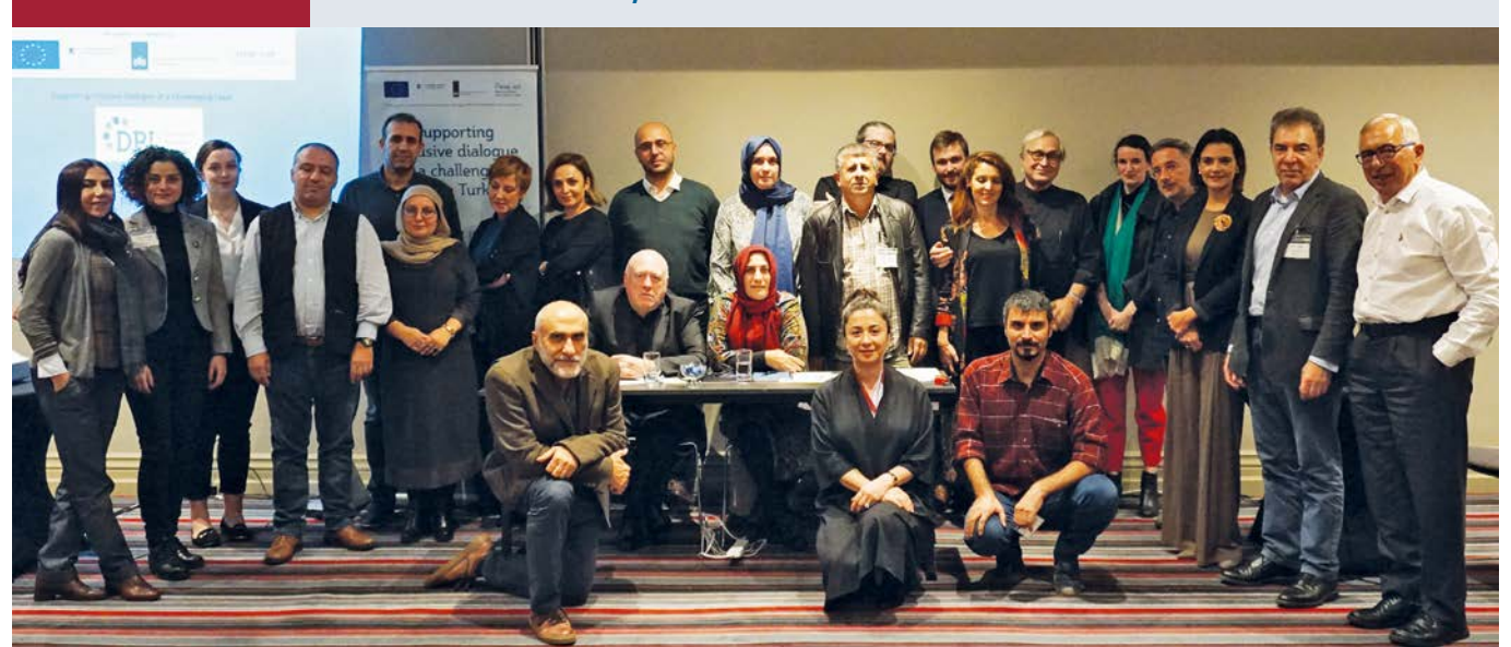
Participants during their first day of meetings in Dublin

The role of media in conflict resolution, hosted by the Irish Department of Foreign Affairs and Trade Dublin and Belfast, 16-19 October