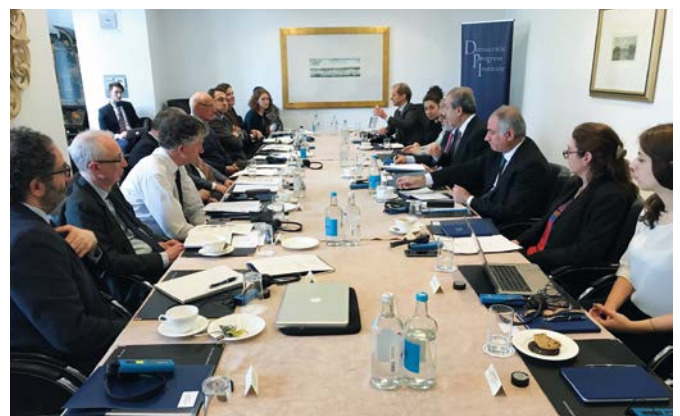
DPI advisers and AK Party delegation exchange views

The meeting provided a fruitful discussion and exchange with participants being able to hear the delegates' views on the current situation in Turkey and the wider region, as well as on the future of Turkey, including the relationship with the EU.