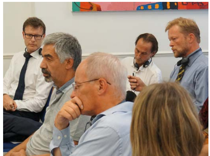
Q&A session at DPI during the assessment meeting

The speakers discussed the changes brought about by the new presidential system and the likely short and long-term implications, both domestic and regional. A productive discussion followed, during which participants were able to comment, respond and ask questions to the speakers.