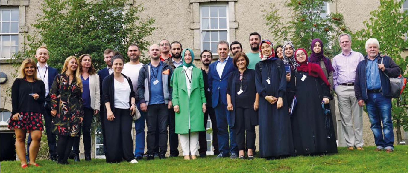
Youth representatives from Turkey gather during the CSV on youth engagement in conflict resolution at Glencree Centre in Co. Wicklow

Youth engagement in conflict resolution processes, hosted by the Irish Department of Foreign Affairs and Trade Dublin and Belfast, 1-5 August