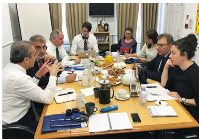
AK Party Delegation at DPI office