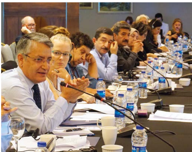
Some participants at the meeting

In September, a group of 50 participants, including politicians, policy-makers, civil society actors, academics, and journalists, came together to discuss experiences from peace and transition processes globally. The meeting provided a timely opportunity to review previous discussions on the nature of peace-making processes and highlighted the importance of preserving the foundations for inclusive dialogue between different parties and groups in society, even in the most challenging times.