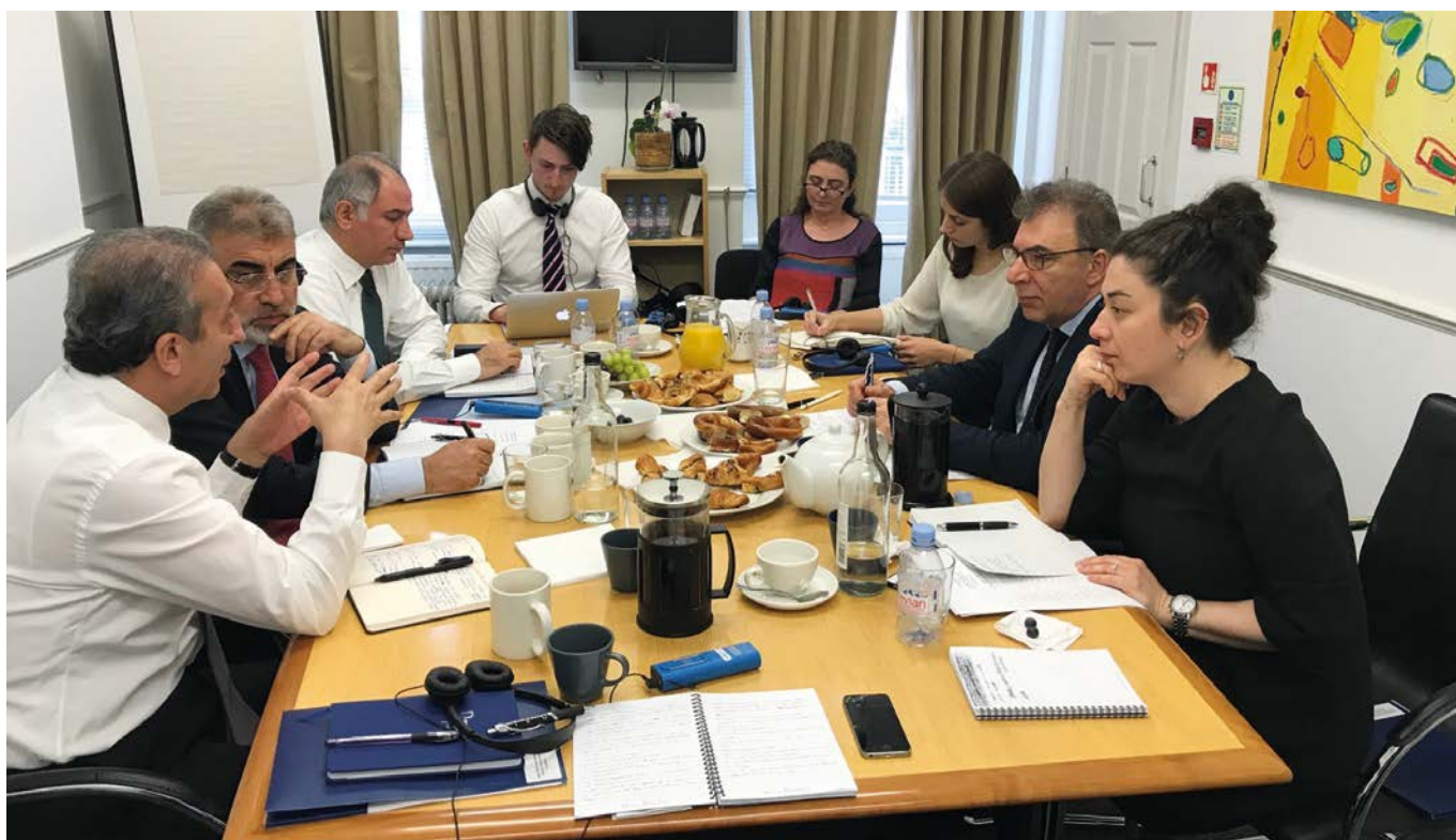
AK Party Delegation at DPI office

DPI activities are underpinned by the need for equal gender representation, but we have also held a number of roundtables focused on the specific role of women in conflict resolution. We held two roundtable meetings with this focus in Turkey, which were attended by a diverse female group of political and civil society actors from different regions and representing a broad spectrum of professions and political affiliations in Turkey. Participants included MPs and members of political parties, heads and representatives of human rights organisations, lawyers, businesswomen, media professionals, academics and figures from the art and literature worlds.