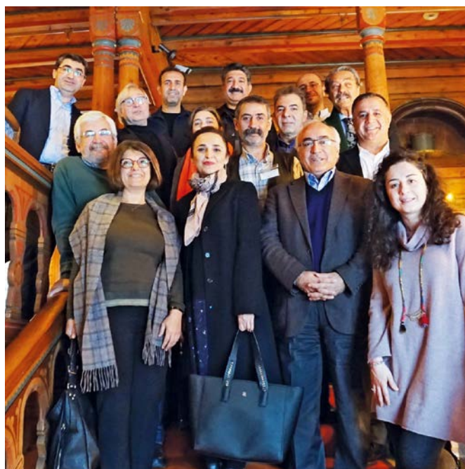
Some participants at the Roundtable meeting in Oslo

This roundtable was the second planned event under the theme 'Supporting Inclusive Dialogue at a Challenging Time in Turkey' and it was organised as a response to the requests of participants to the first roundtable that took place in May 2018. In fact, participants, after having heard and elaborated on international experiences about conflict resolution, they expressed their wishes to continue to address the theme focusing more specifically on WPC experience. Feedback from participants was helpful as it showed that they are looking to keep the conversation alive in the future. Hence, DPI will continue to work with them, and it will also expand the number of participants for bringing together more former members of WPC.