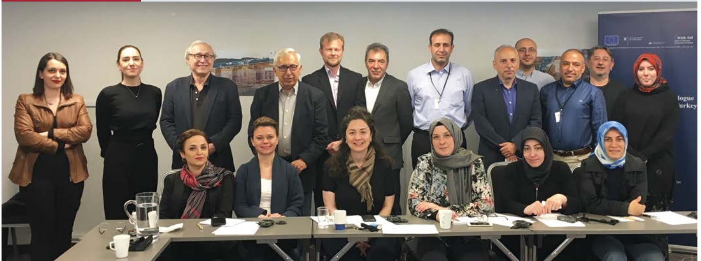
Some participants and speakers gather to discuss the role of the media in conflict resolution in Oslo

The role of media in conflict resolution, hosted by the Norwegian Minister of Public Affairs Oslo, 25-27 April