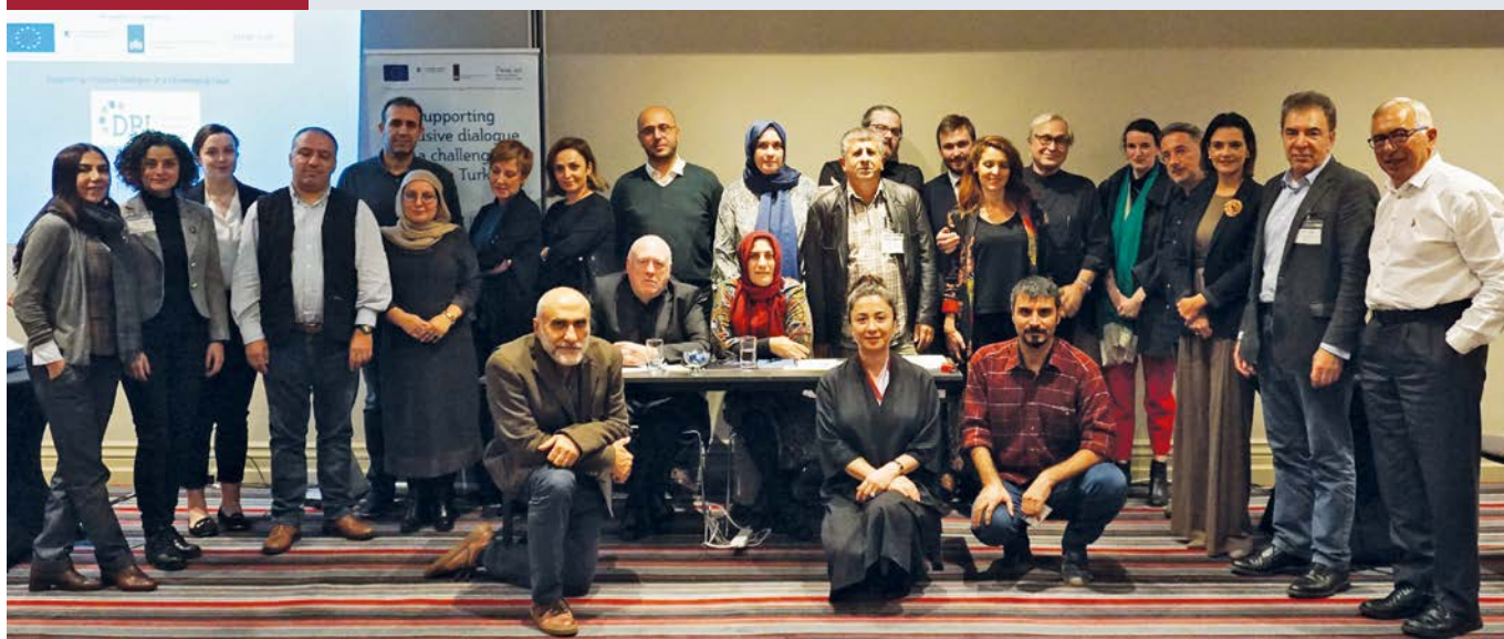
Participants during their first day of meetings in Dublin

In April, DPI organised a follow-up RT on the role of media from 16th to 19th of October, which was held in Dublin and Belfast. The participants comprised a varied group of participants from Turkey's mainstream and alternative media, brought together to discuss their role in conflict resolution processes. A range of speakers addressed the participants and discussed the Colombian and Northern Irish peace processes.