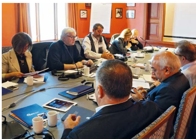
Participants discussing during the meeting

The event has also been covered by Turkish media, receiving positive feedback on newspapers, TV channels and on social media. Despite negative feedback has been received as well by some Turkish media, the fact that DPI's activities have appeared in the news show that society is eager to discuss the resolution process.