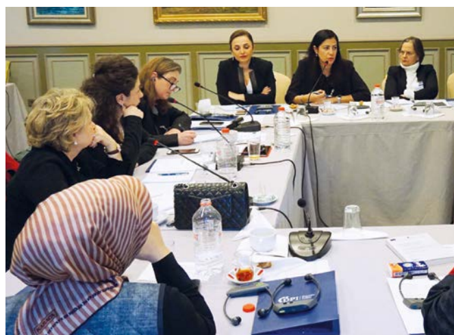
Women from Turkish civil society and the political sphere share their experiences of working on conflict resolution

A full transcript report of this event can be found on our website and in print.