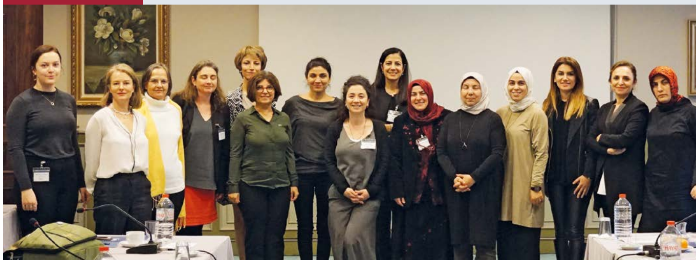
Some participants at the meeting on women in conflict resolution in Istanbul

In December, a diverse group of women participated at a DPI roundtable to reflect on women's contributions to sustaining dialogue and maintaining efforts to build peace.