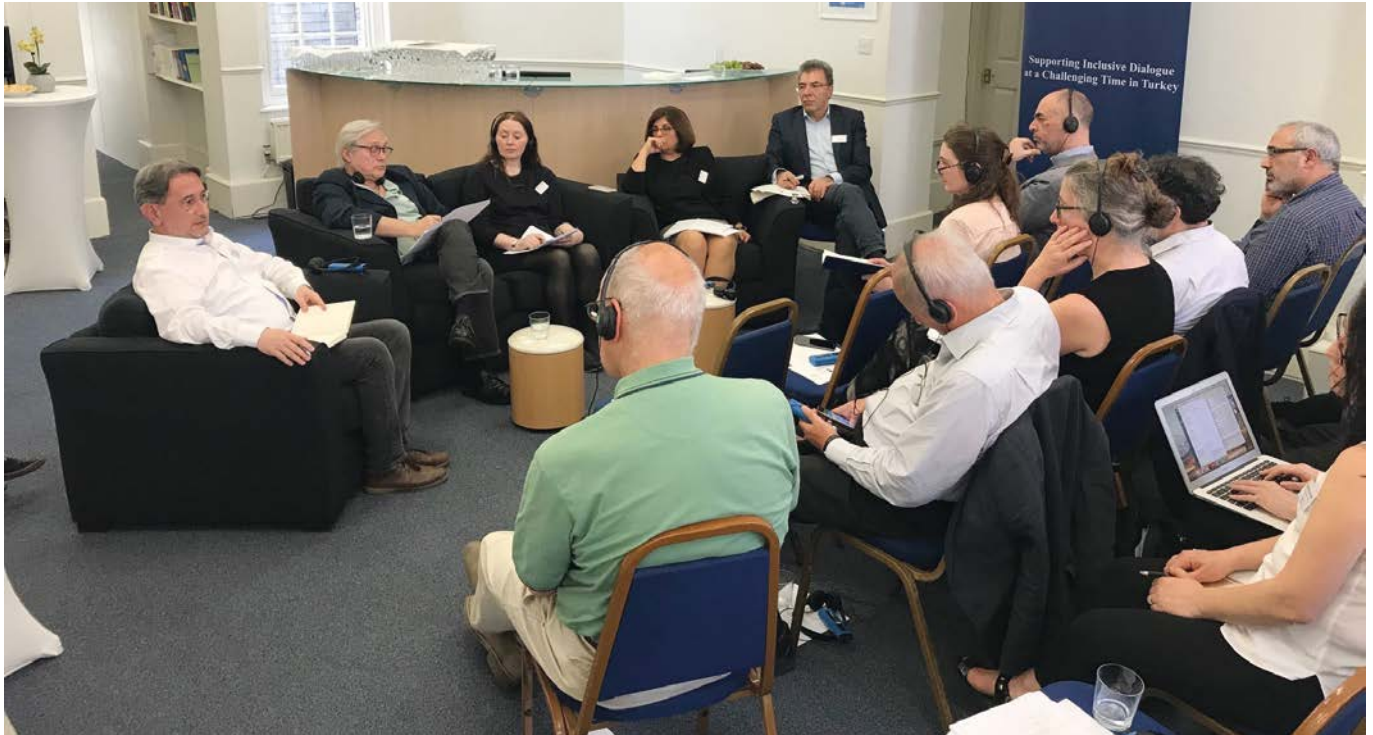
Assessment meeting at DPI office

This approach has continuously given participants a unique opportunity to learn from other conflicts and to explore potential solutions with experts who have practical experience. Participants feedback stresses the importance and impact on the ground of DPI's activities in fostering dialogue with their wider communities.