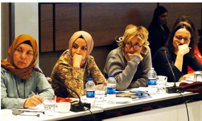
Some participants listening to speaker presentation

Many participants suggested that it would be useful to have a meeting to discuss women's role in conflict resolution in direct relation to the situation in Turkey. As such, DPI organised a roundtable held in December to focus on the sharing of international experiences and how the latter can provide lessons and insights of relevance to Turkey.