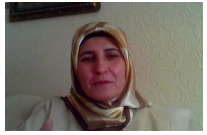
Participant contributing to the discussion on Turkey

Another participant who is an active civil society actor talked about turning crises into opportunities. In 2011, when the Syrian conflict emerged, the cities by the Syrian border deeply felt the consequences of the conflict as there was a major flux of refugees. In Urfa, civil society organisations formed a platform for humanitarian aid and brought together different civil society organisations. When the conflict did not end as they had initially anticipated, the platform continued to grow and increased their capacity, reaching more places and, with the help of a diverse range of