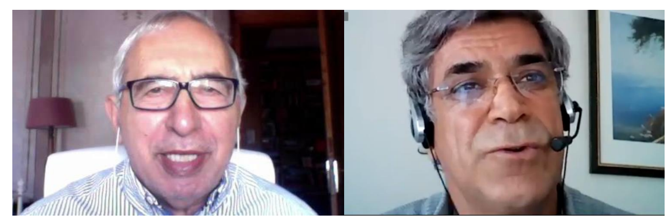
Participants ask questions during the discussion session

United Ireland, Northern Ireland, a variation of federalism, or within the UK? Here, a lot also depends on the reaction of the Republic of Ireland. If they look inwards and do not take account of Northern Ireland, it will be a step back. Finally, it should also be noted that the pandemic could present some opportunities, bringing people from across community divides together and raising socio-economic issues.