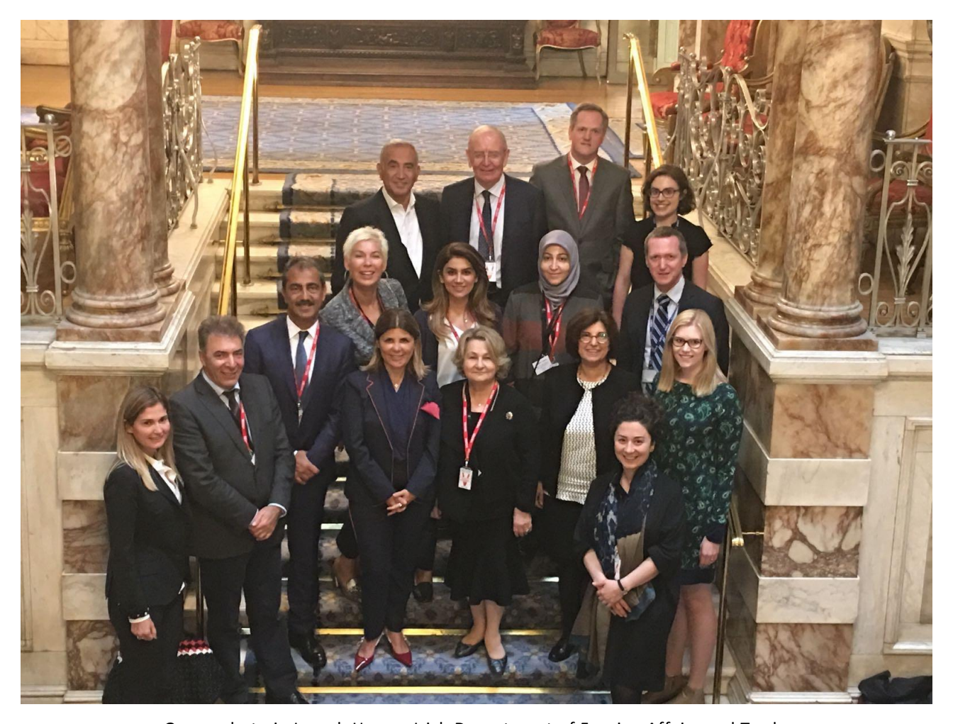
Group photo in Iveagh House, Irish Department of Foreign Affairs and Trade