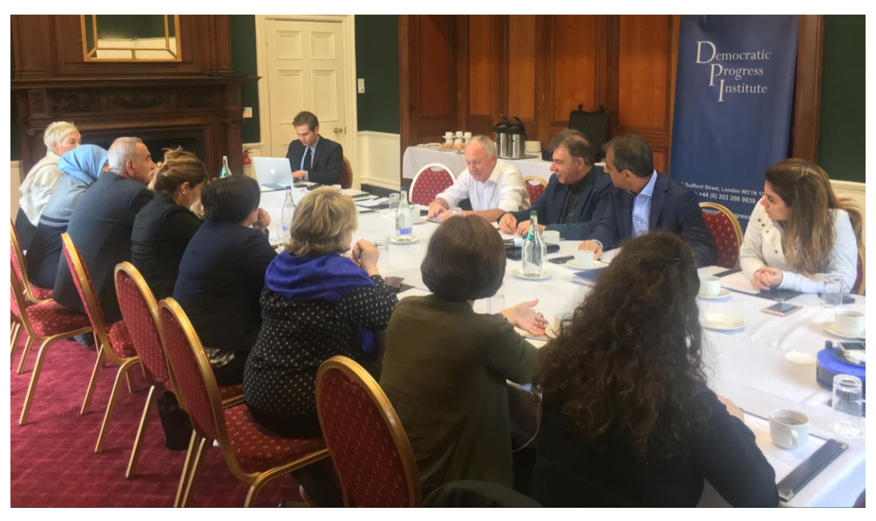
Dermot Ahern discusses the economic changes experience after the peace process