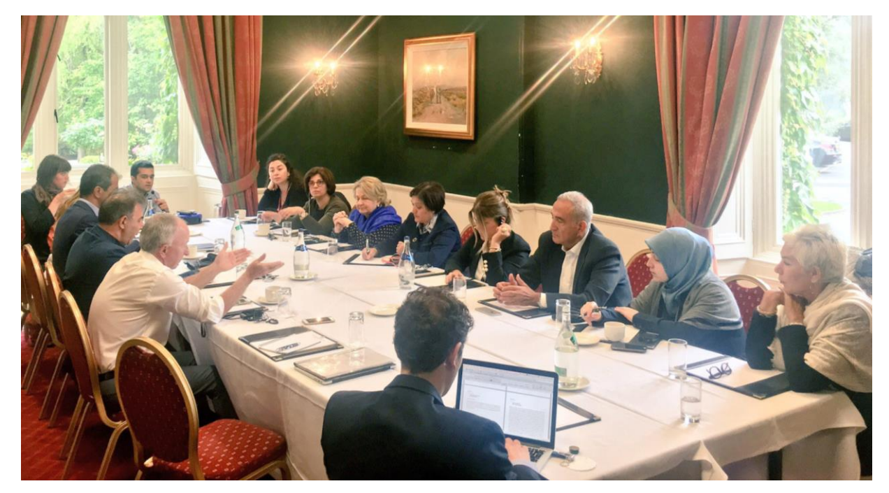
Roundtable with Dermot Ahern

number of times the Union Jack would be flown to 17 and the Unionists objected. This is where social media comes in; social media and Belfast was thriving, economics were coming back. That weekend a row grew and social media went into half orbit and in hours 10,000 young people who haven't been protesting before, they were out there because of this issue with the Union Jack. Now you have to live with it in politics and I am glad that I am out of politics.