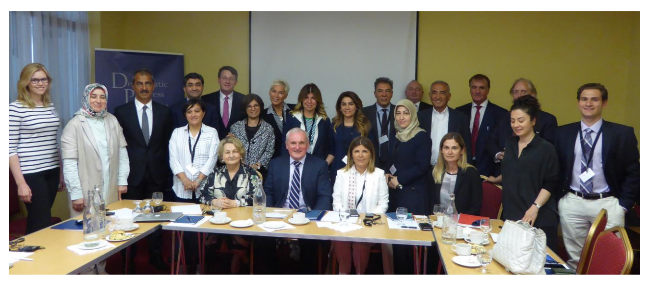
Participants with former Irish Taoiseach, Bertie Ahern.

This was the first visit carried out by DPI exploring the relationship between conflict and the economy and the role of business communities in encouraging and supporting peace, which DPI considers an important factor in working towards a conflict resolution process. It builds on and complements DPI's work on related topics including the role of women and of civil society in peace processes, as well as means of getting a process back on track and continuing dialogue in difficult times. It also reflects DPI's belief that such challenging times as Turkey is now experiencing, with mutual distrust on all sides and continued violence in the southeast of the country, can provide an important opportunity to prepare society for the moment when the process regains momentum.