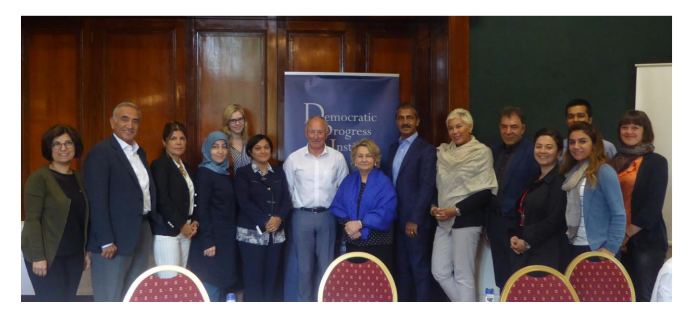
Participants with former Irish Minister of Foreign Affairs and Defence, Dermot Ahern

Overall the comparative study visit proved to be informative and engaging for the participants with valuable sharing of experiences from the Irish experts. DPI intends to build on this visit through ongoing work in the area of business, the economy and conflict resolution, and will continue to draw on comparative case studies.