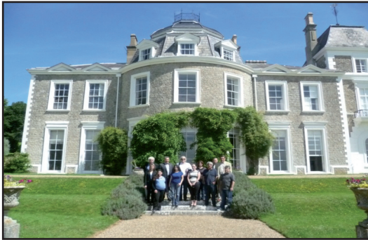
Delegation outside Oxon Hoath Manor, Kent, United Kingdom

The delegation is warmly welcomed to Oxon Hoath Manor, Kent, United Kingdom.