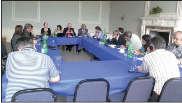
The delegation at the Roundtable meeting at Oxon Hoath Manor, Kent, United Kingdom