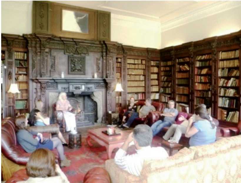
The delegation met in the library of Oxon Hoath Manor for an internal evaluation roundtable meeting.

The delegation attended an internal evaluation roundtable meeting before enjoying a final dinner together hosted by DPI at Oxon Hoath Manor.